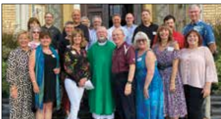
Class of 1977