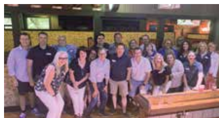
Class of 1987