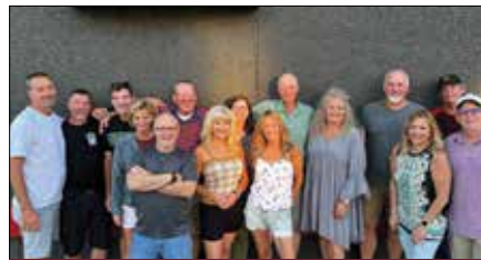
Class of 1983