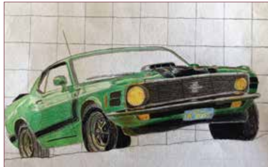
Tommy Bower, sophomore Colored Pencil Grid Drawing