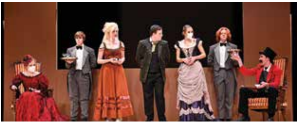
The EHS Drama Department presented "A Gentleman's Guide to Love and Murder" in November

Rehearsals are underway for the Spring 2023 show, the epic period musical "Les Misérables"! Join us March 23-26 to appreciate and support EHS Performing Arts!