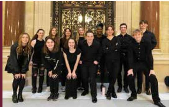
EHS Choral group at the 98th annual Capitol Christmas Pageant