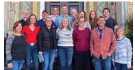
Class of 1992