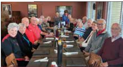
Class of 1957

Many Crusader classes have been gathering for reunions! Be sure to let us know about your class gatherings and send photos!