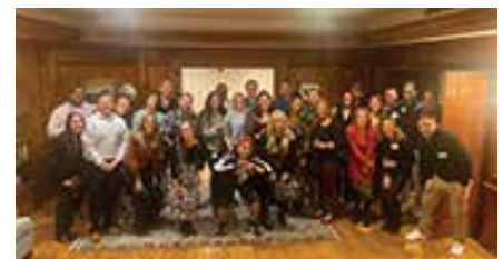
Class of 2002